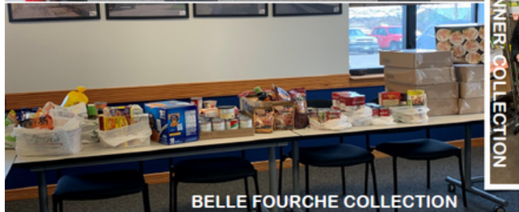
BELLE FOURCHE COLLECTION