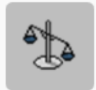
HC60 MS&T Train

Navigate through various screens for creating samples and entering test results on construction projects in this self-paced online course.