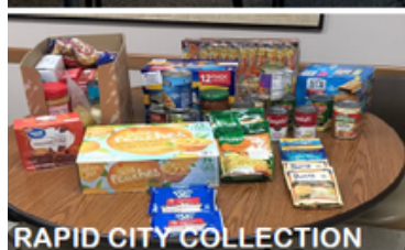
RAPID CITY COLLECTION