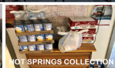
HOT SPRINGS COLLECTION