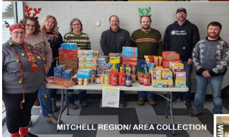
MITCHELL REGION/ AREA COLLECTION

Holiday Smackdown 2022 We collected $1737 and 5024 items for 14 organizations across the state in the midst of a blizzard. AMAZING!