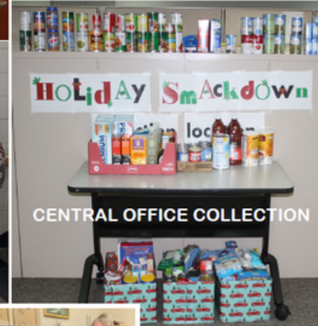
CENTRAL OFFICE COLLECTION