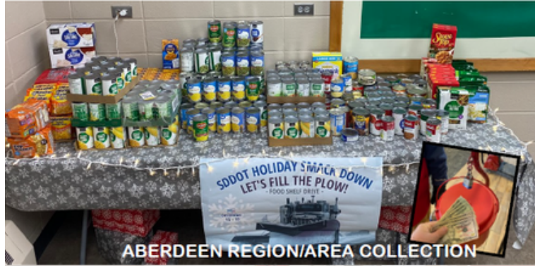
ABERDEEN REGION/AREA COLLECTION