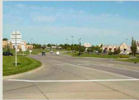
Corridor preservation can set aside land along a developing roadway for future widening.