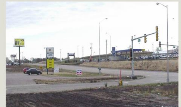
Adjacent development can restrict roadway expansion, causing congestion and compromising safety.