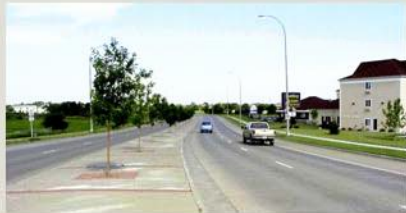
Corridor planning produces attractive, free-flowing streets.