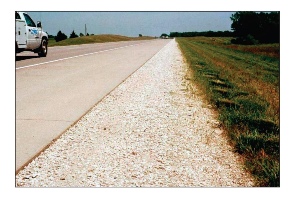
Figure 1. Daylighted permeable base on US 50 in Kansas (Gisi, Brennan, and Luedders 2004).

Figures 1 and 2 show examples of the daylighted permeable base layers. The permeable layer used for the South Rochford Road crossing would be designed to convey both surface water and shallow groundwater. A culvert could also be incorporated to handle some of the baseflow and to provide a secondary route for snowmelt runoff if the base layer were to freeze. The permeable base would still serve its purpose in connecting the groundwater flow across the roadway and providing a media for spreading out some of the flow at the crossing.