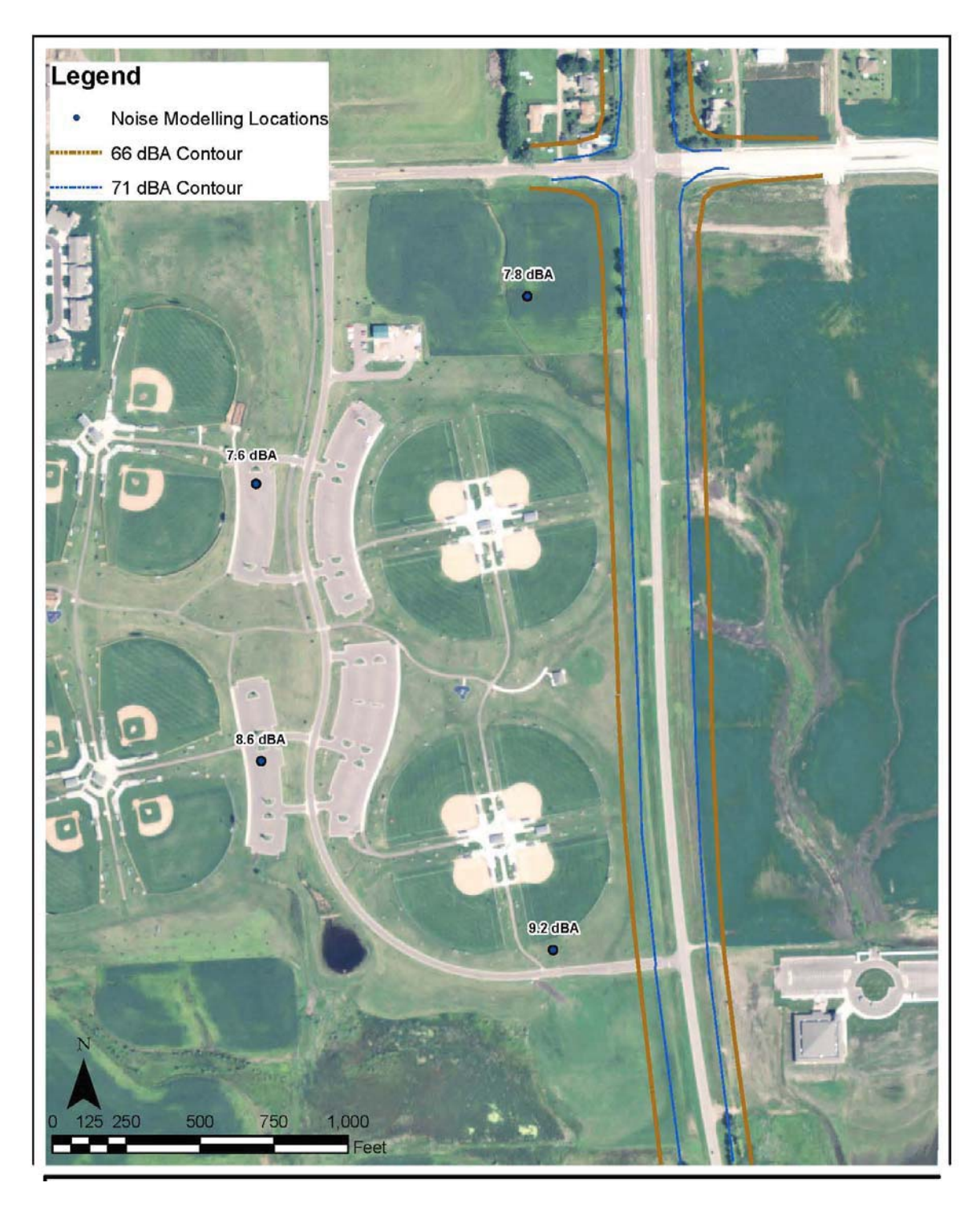
Figure F-2 Noise Impacts- Harmodon Park