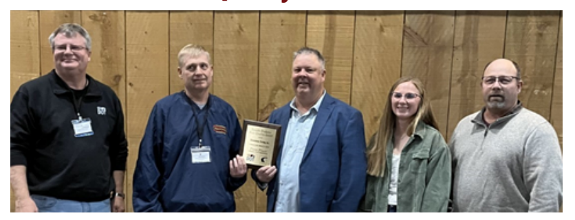
The project on S.D. Highway 44 from U.S. Highway 83 Jct. east to Wood, S.D. with Bituminous Paving Inc. as the prime contractor won 1st place in the Ride Quality Awards for a two-opportunity project at the 2025 DAPA Conference in Deadwood.

This project involved full-depth reclamation, spot grading, and asphalt surfacing.